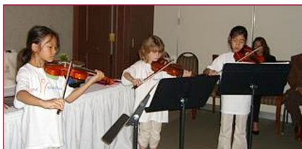
September General Meeting Pictures

Please RSVP at 993-9109 or mtwerden@charter.net