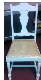
The Before Look of the Chairs that the Artists will transform.